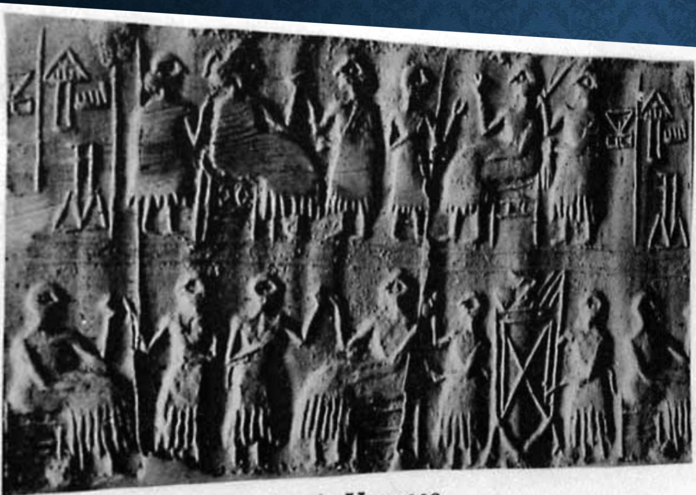
16. U. 10939